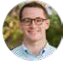
Van Barnhill High School