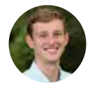
Will Kramer Middle School